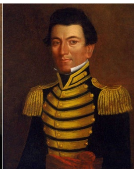
JUAN SEGUIN $500