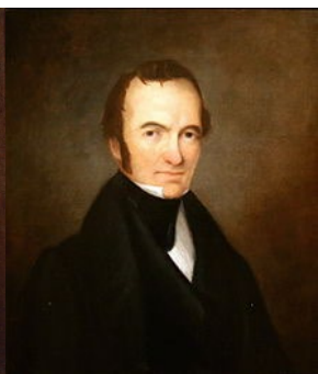
STEPHEN F. AUSTIN $250