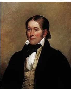
DAVY CROCKETT $1000