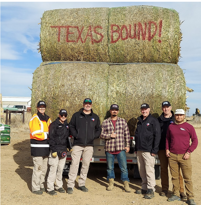
One of the key roles that volunteers played during the Panhandle wildfires was acquiring and distributing hay for cattle.

The Panhandle wildfires presented great opportunities and challenges for team members. TEXSAR volunteers took a key role in acquiring more than 1000 bales of hay and miles of fencing materials to provide relief to the ranchers in the area. Interesting note: 85% of the state's cattle are in the Panhandle area. See more information in the "Mission Matters" section of this newsletter.