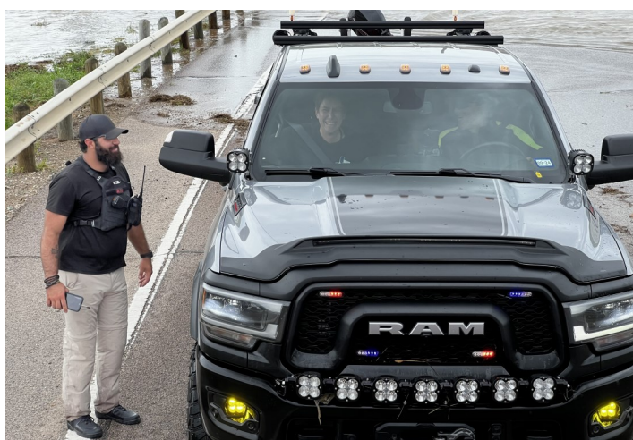
TEXSAR volunteers, boat in tow, head through rising waters to be of assistance during Hurricane Beryl.