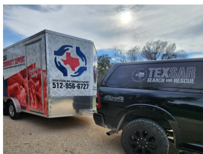
A new, outfitted trailer for Community Support was provided thanks to a generous grant from Mary Moody Northen Endowment. Thank you!