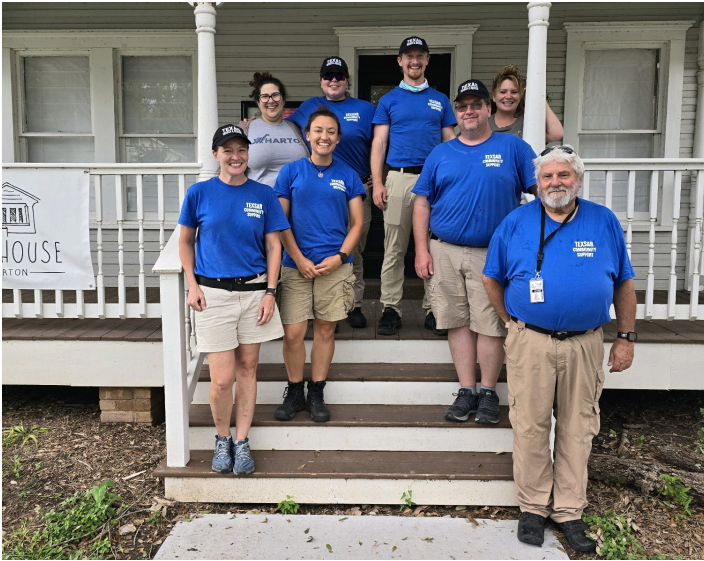
Community Support members provided assistance at Hedes House in Wharton.