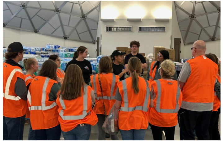
Volunteers join in a briefing during the wildfire mission.