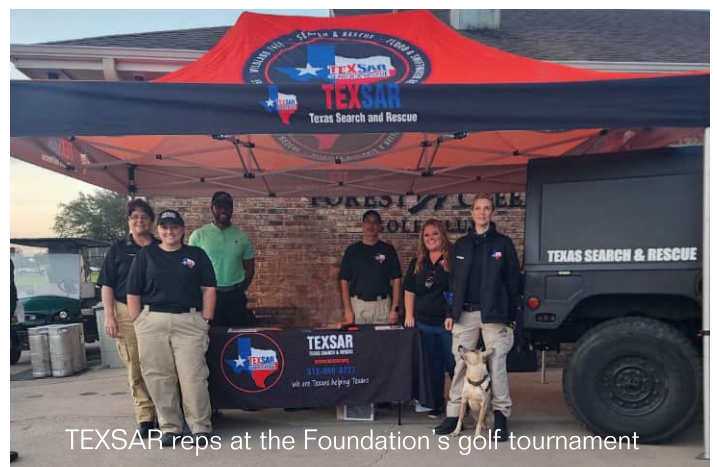
TEXSAR reps at the Foundation's golf tournament